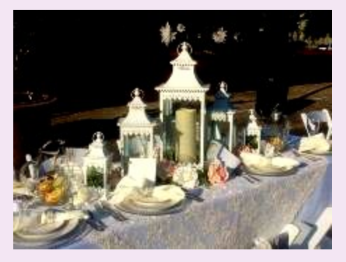
Patrons could arrive at 2:00 p.m. to begin decorating their tables for the table contest.

There were lots of beautiful flowers and displays.