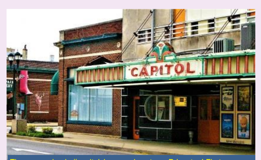
The one and only <u>#capitolcinemas</u> downtown Princeton! First run movies, 1930's Art Deco theater. And the best popcorn around.