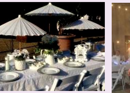
The winning table design a little before completion.