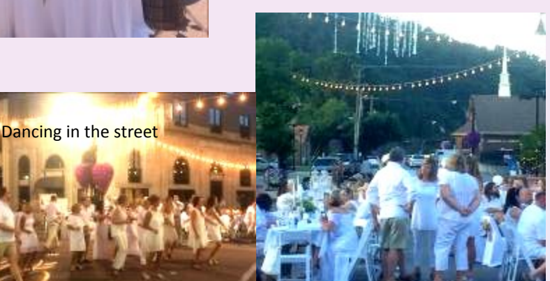
brought to you by the City) of Rhoull and the Plain Street Brogram decloated to the knowlifection and 'revitalization' of OWO downtown Community;